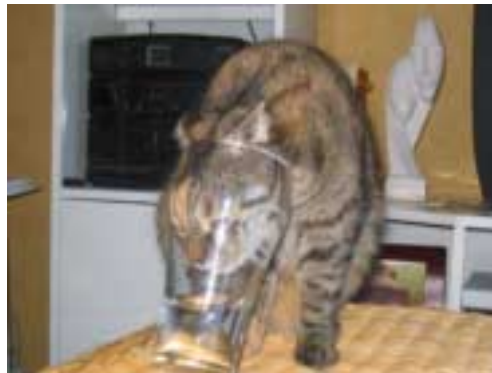
Last call for alcohol!