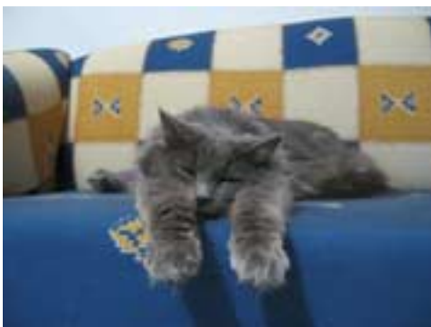
I can't believe I drank the whole thing!