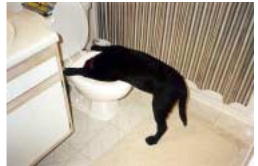
Worshipping the Porcelain God