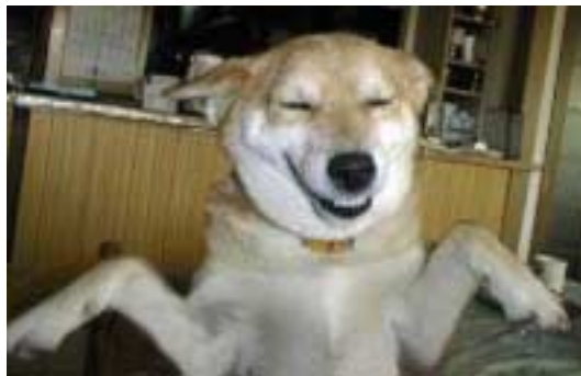
Whee, look at me!