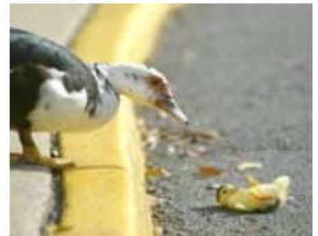
Ossifer, I don't see no straight line!