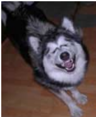
You are sho funny!