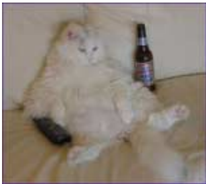
Gimme another beer!